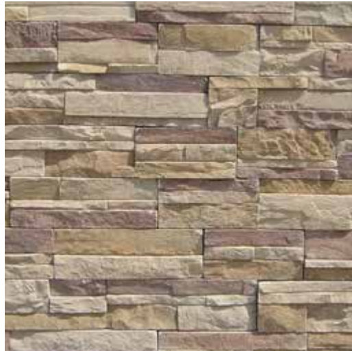
Imperial Stack - Millsap