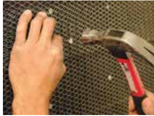
Install corrosion resistant metal lath.