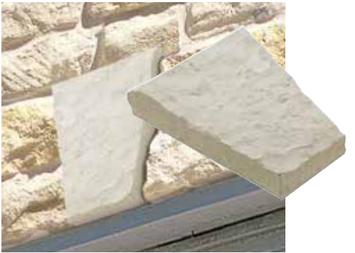
Keystones 10" L x 7.75" W to 4.75" W 2.5" Thick