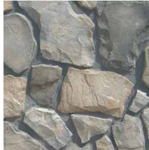
Fieldstone Blue - Creek