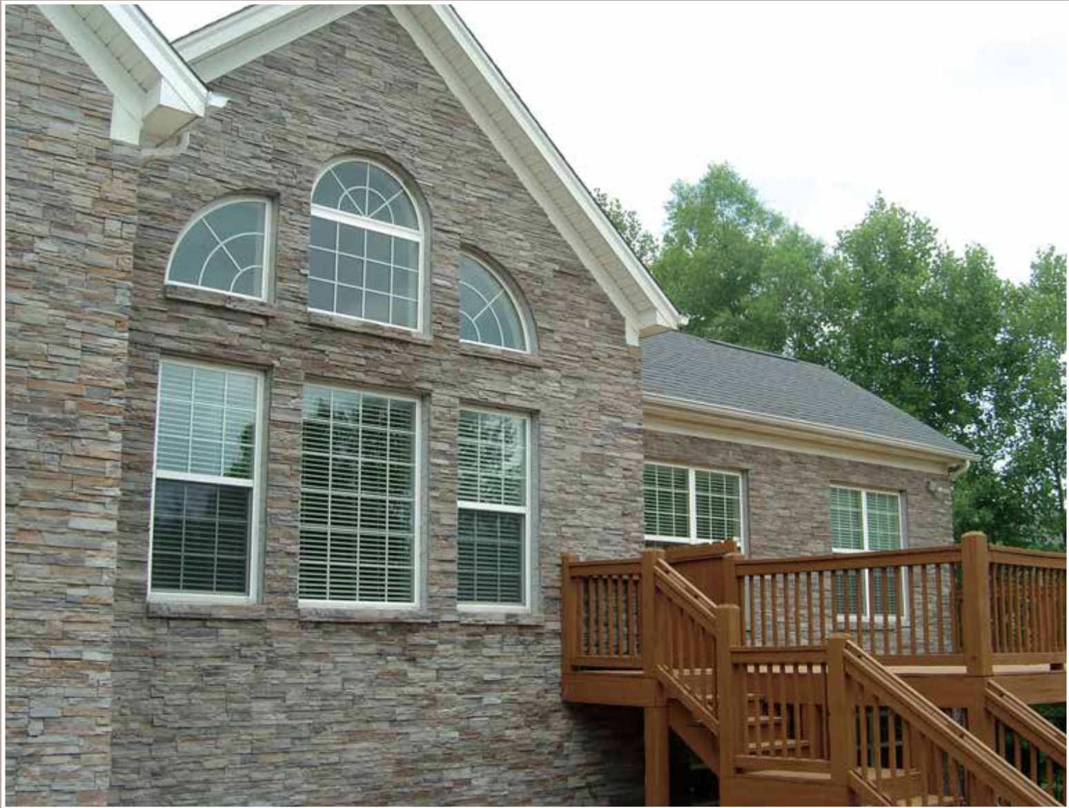
Imperial Stack - Silver