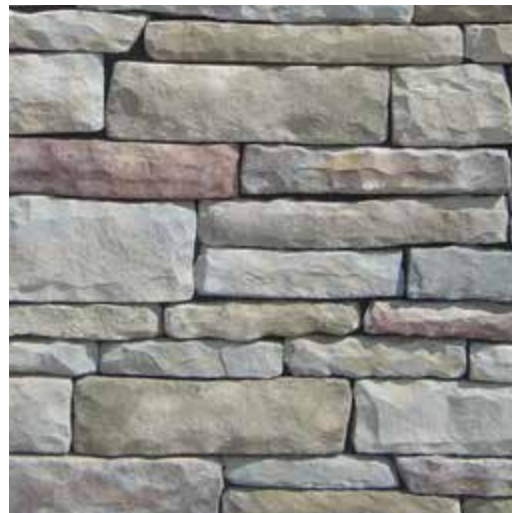
Ledge Stone - Mineral County