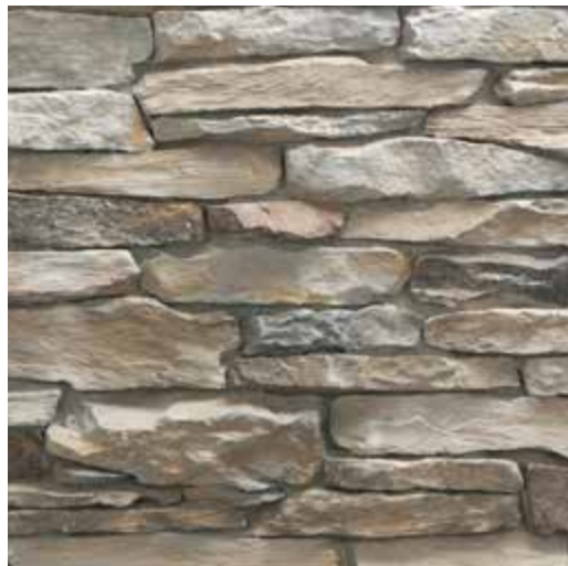
Shadow Ledge - Mineral County