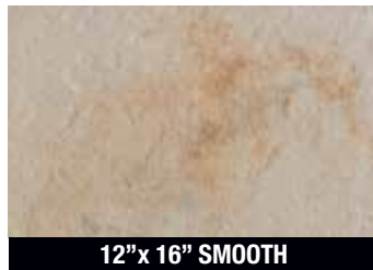
12"x 16" SMOOTH