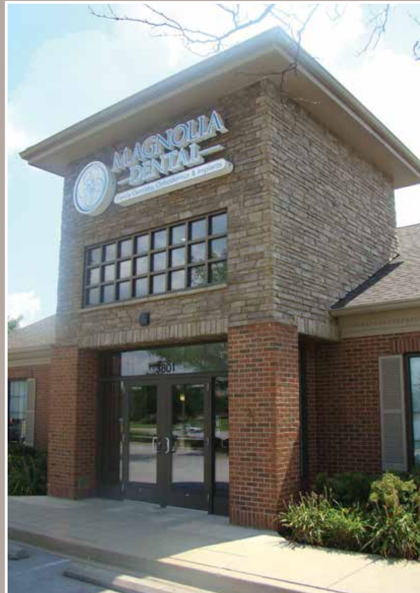
Pacific Ledge - Pine Springs