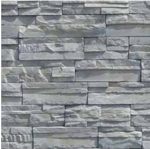
Imperial Stack - Pine Springs