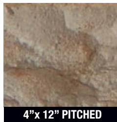
4"x 12" PITCHED