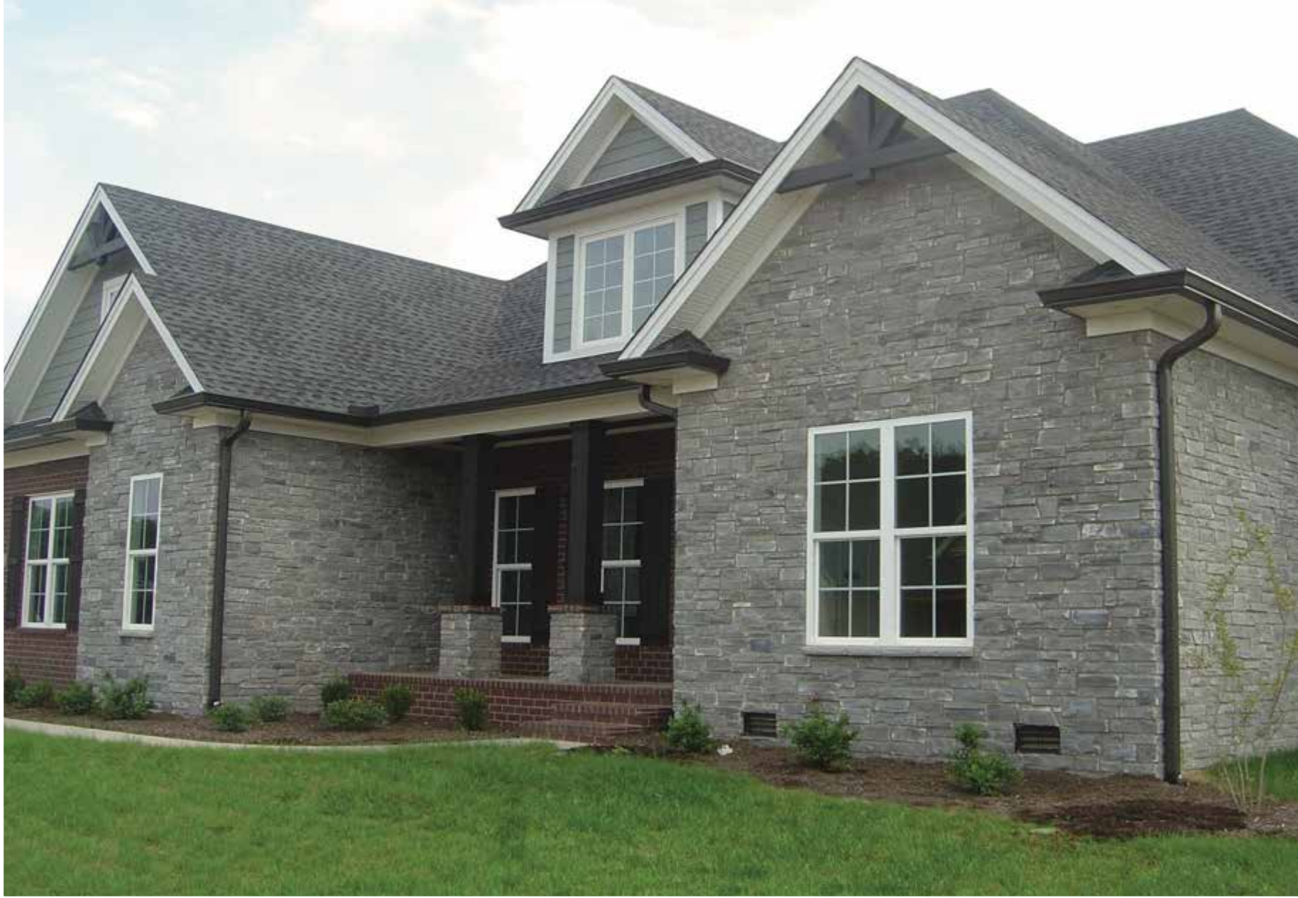
Pacific Ledge - Crestone