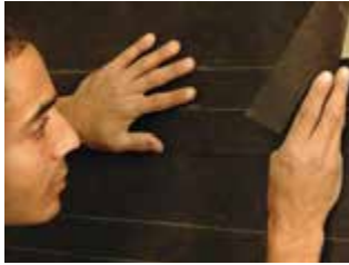
Install water resistive barriers. (exterior applications)

For the most up-to-date installation instructions, please visit our website www.veneerstone.biz