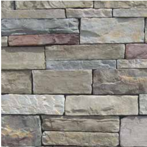
Pacific Ledge - Mineral County