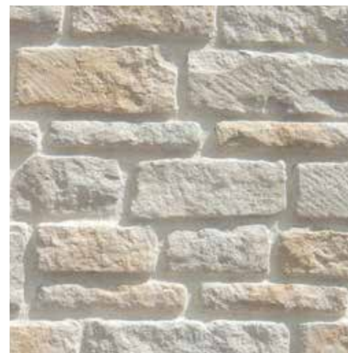
Austin Stone - Buckeye