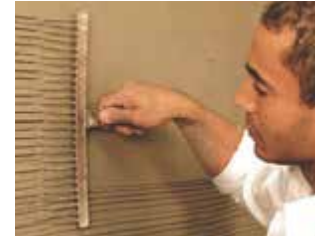
Rake mortar to create scratch coat. Allow to dry.