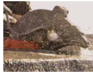
Trim stones to fit.