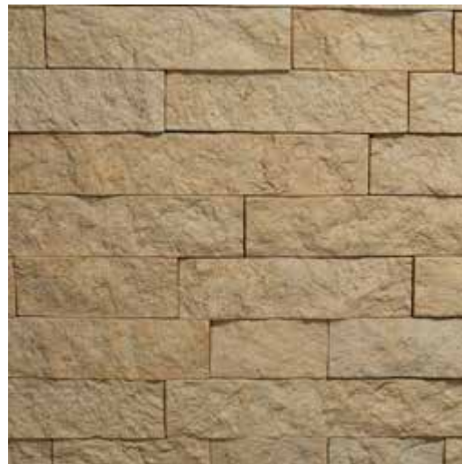
Montana Cut - Beach