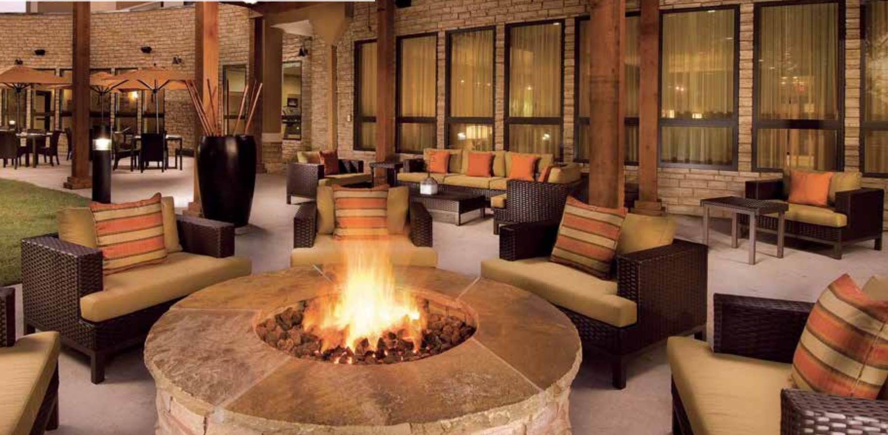
Custom Blend - Custom Color

Our surfaces mimic their natural counterparts because of our unique manufacturing process and strict quality controls.