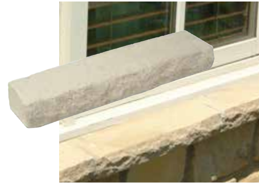
Watertables / Window Sills 18" L x 3.5" W 2" Thick at Front Edge 2.5" Thick at Back Edge