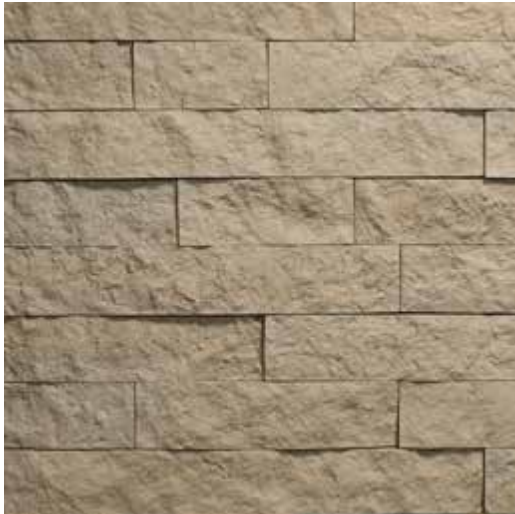
Montana Cut - Linen