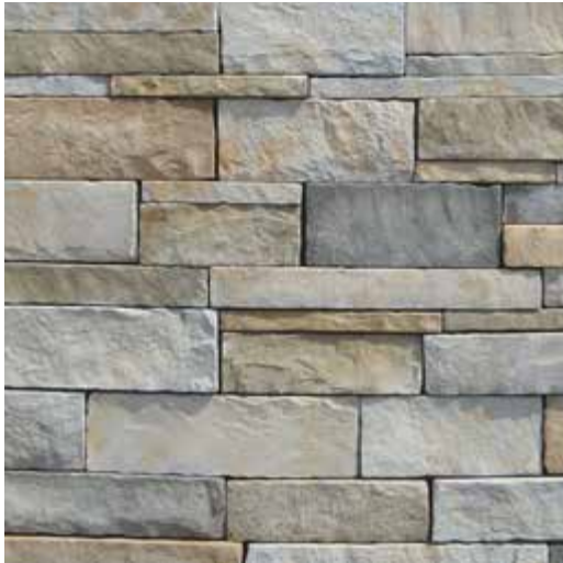
Stack Stone - Blue Creek