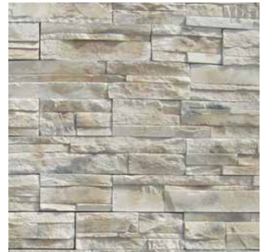
Imperial Stack - Mesa Grey

The product images featured here are as accurate as printing and photographic technology allows.