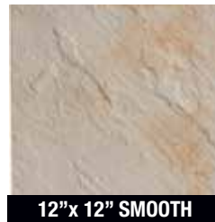
12"x 12" SMOOTH