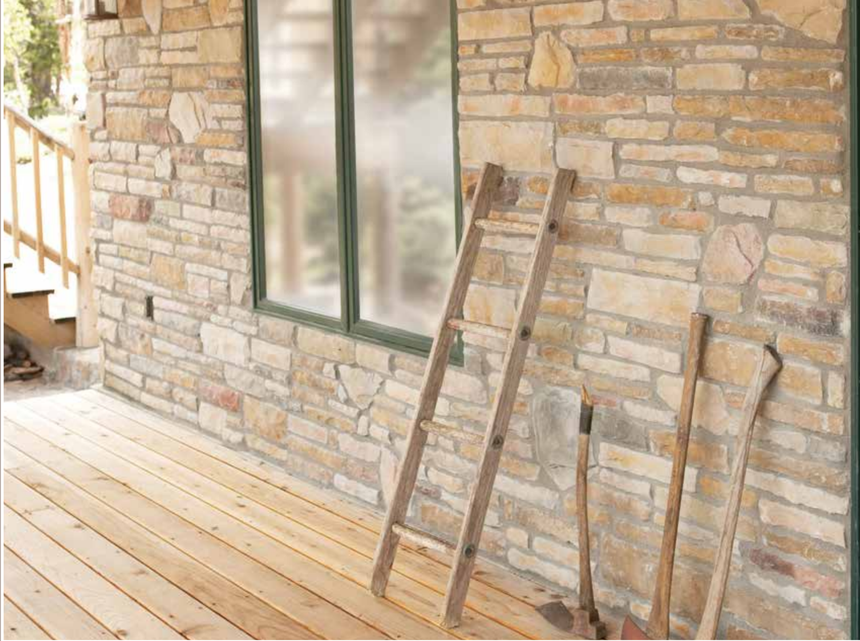
Ledge Stone and Fieldstone Blend - Custom Color