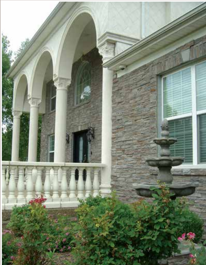
Imperial Stack - Silver