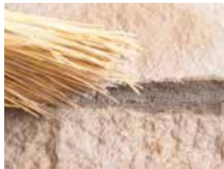
Brush off excess mortar with a dry brush.

NOTE: For specific installation guidelines as an industry standard please visit the MVMA Installation Guide and Detailing for ASTM C 1780 compliance.