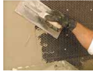
Apply mortar for scratch coat.