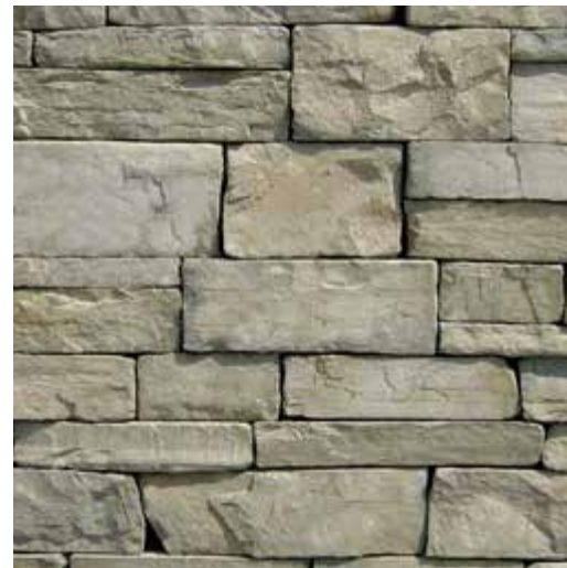
Pacific Ledge - Creede