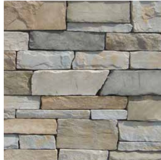
Pacific Ledge - Blue Creek