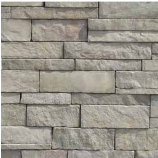
Stack Stone - Creede