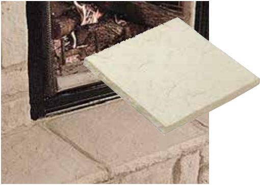
Hearthstones/Flat Wall Coping Stones 19" L x 20" W 1.75" Thick