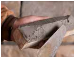
Apply mortar to the entire back of the stone.