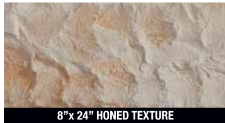
8"x 24" HONED TEXTURE