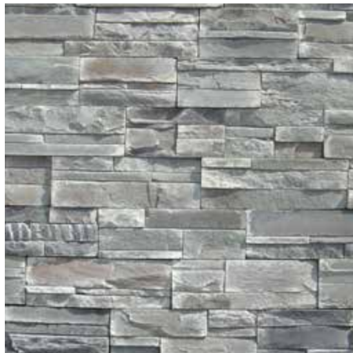
Imperial Stack - Crestone