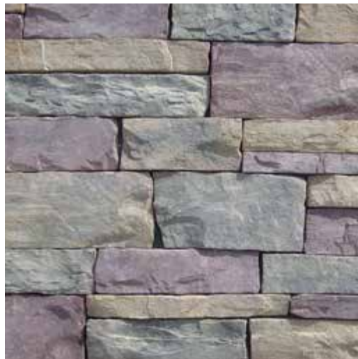
Pacific Ledge - Redwood