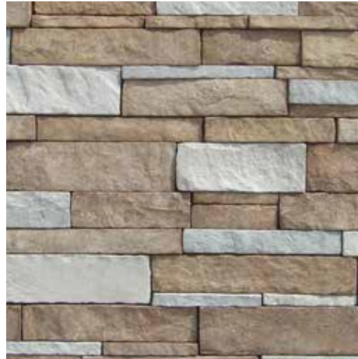
Stack Stone - Texas Cream