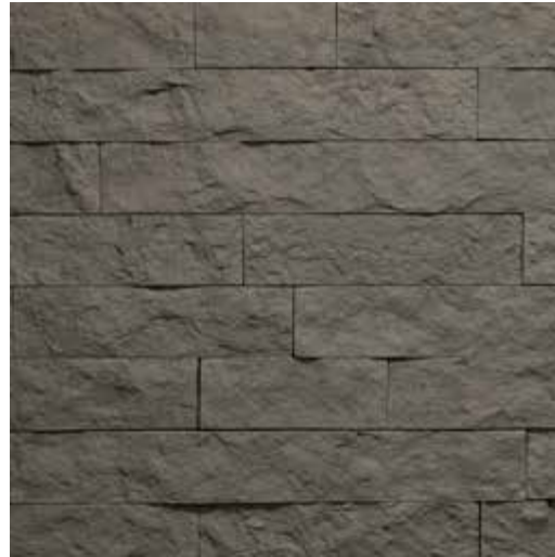
Montana Cut - Tahoe