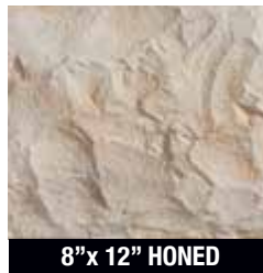
8"x 12" HONED