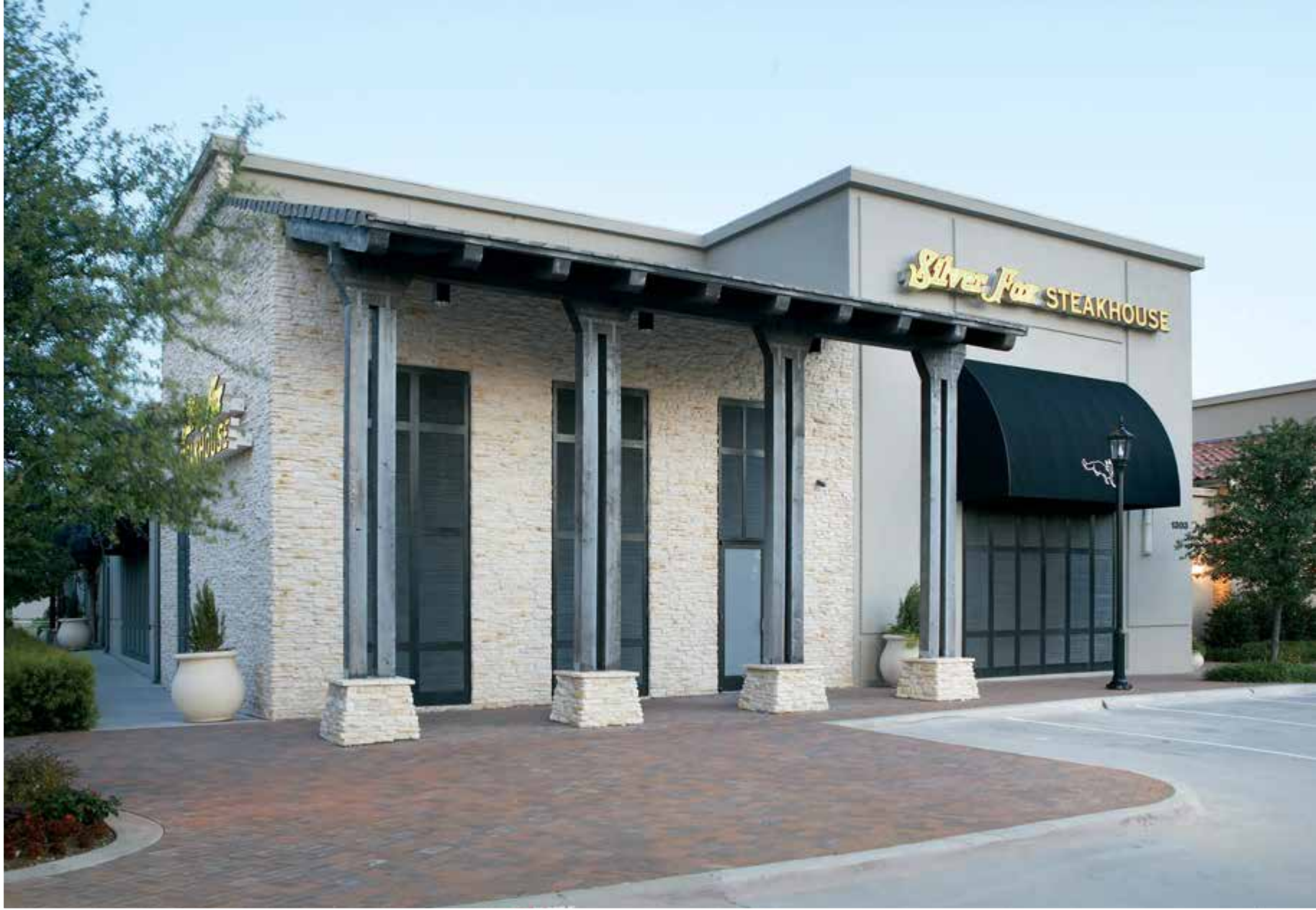
Pacific Ledge - Custom Color