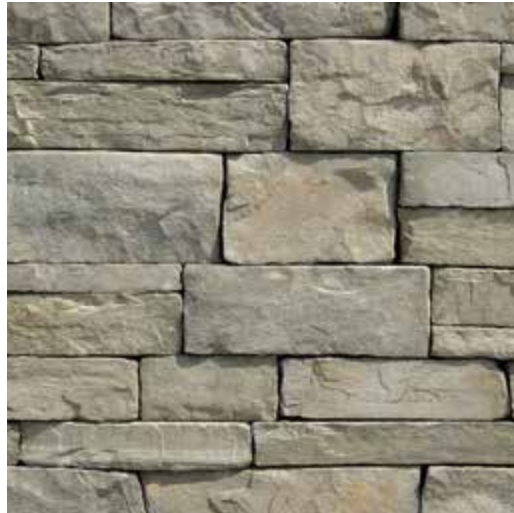
Pacific Ledge - Pine Springs