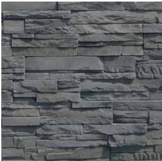
Imperial Stack - Graphite