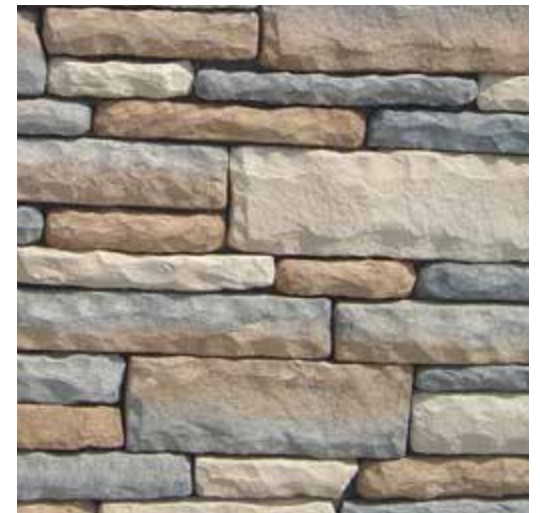
Ledge Stone - Malbeck

The product images featured here are as accurate as printing and photographic technology allows.