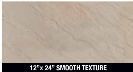
12"x 24" SMOOTH TEXTURE