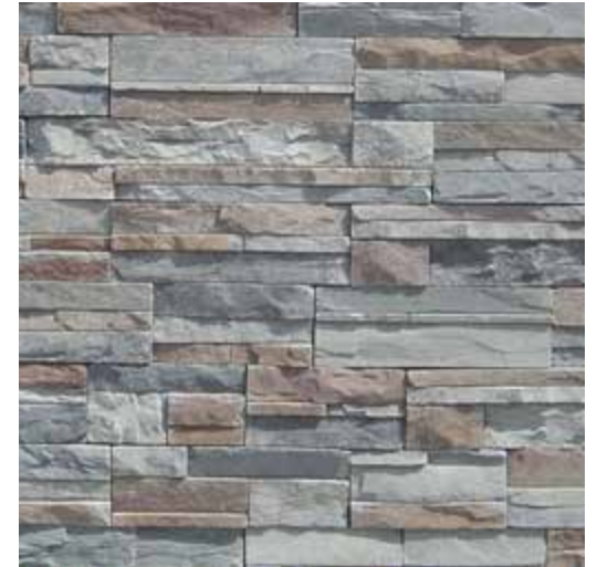
Imperial Stack - Silver