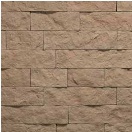
Montana Cut - Oxford