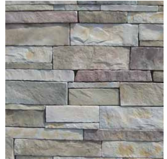
Stack Stone - Mineral County