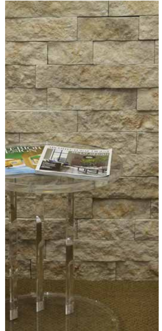
Montana Cut - Custom

The product images featured here are as accurate as printing and photographic technology allows.