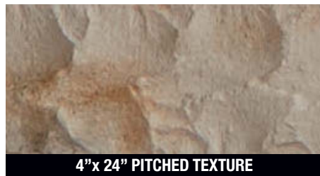
4"x 24" PITCHED TEXTURE