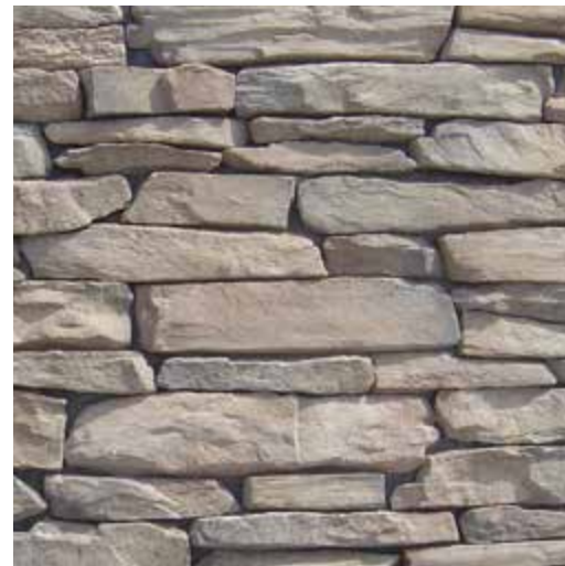
Shadow Ledge - Walnut