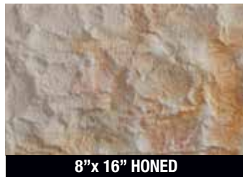
8"x 16" HONED