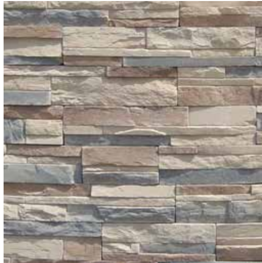
Imperial Stack - Malbeck