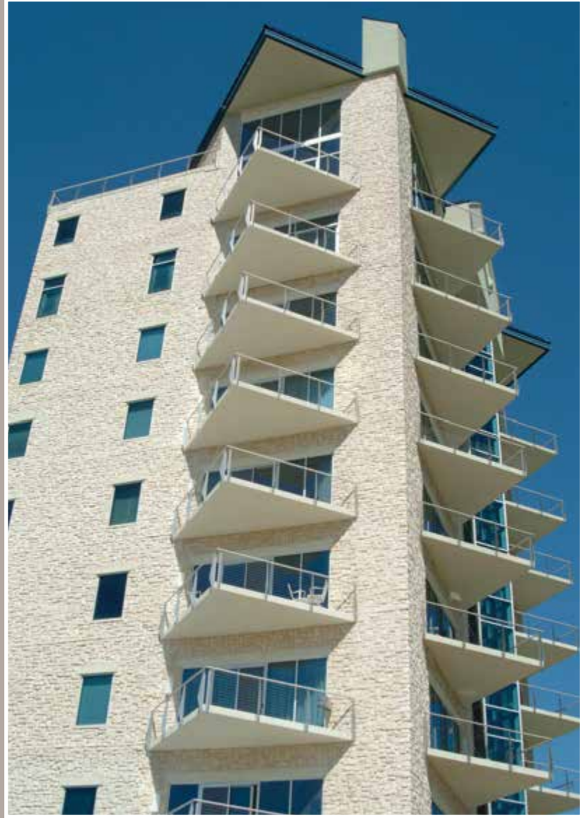
Austin Stone - Buckeye