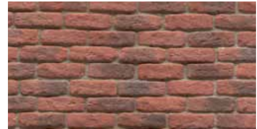
Red with Black