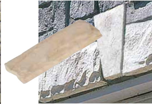
Headerstones 22.5" L x 8" W 2.5" Thick