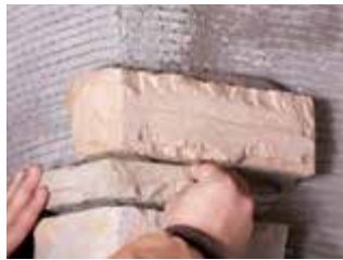
Install corner stones first.