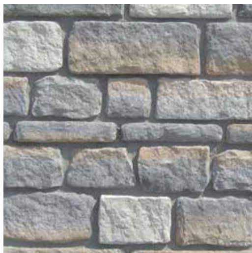
Austin Stone - Silver