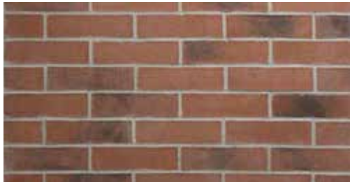
Red with Black