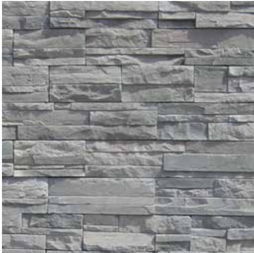
Imperial Stack - Slate