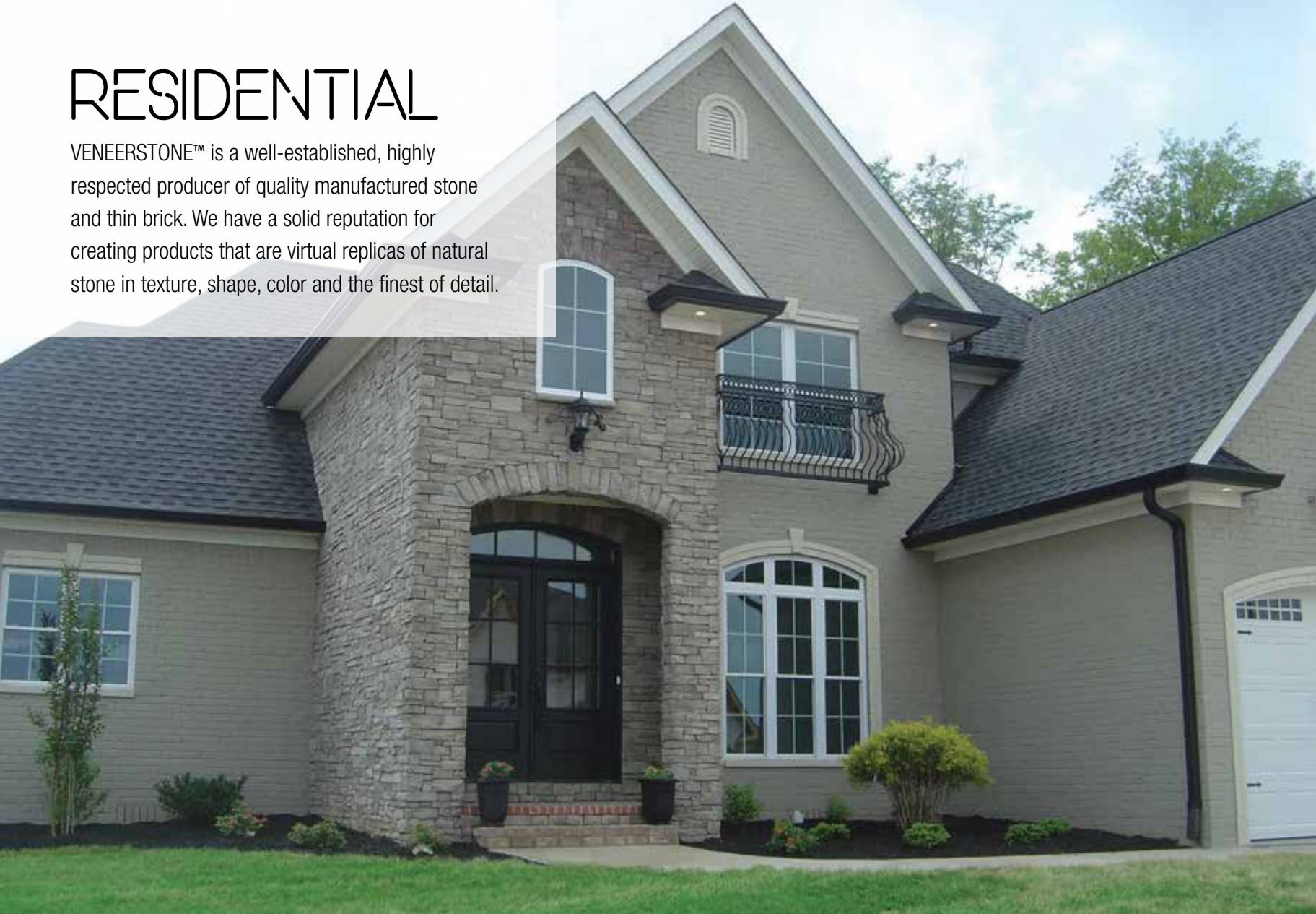
Pacific Ledge - Pine Springs

VENEERSTONE™ is a well-established, highly respected producer of quality manufactured stone and thin brick. We have a solid reputation for creating products that are virtual replicas of natural stone in texture, shape, color and the finest of detail.