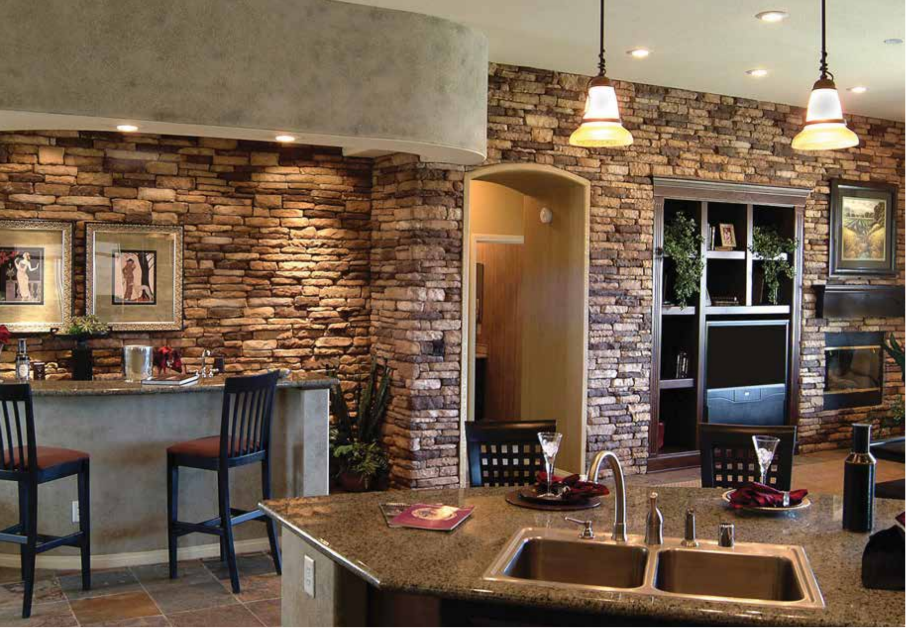
Ledge Stone - Malbeck