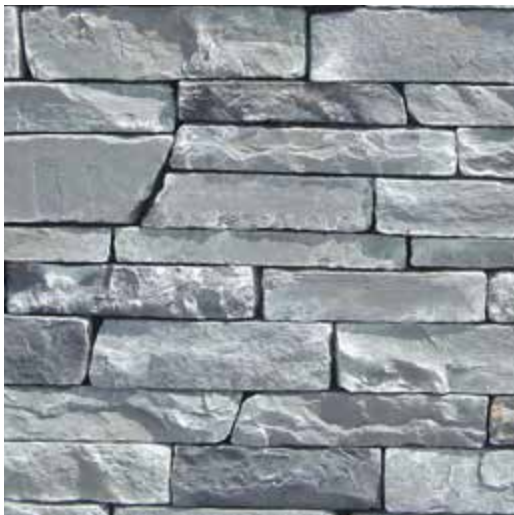
Pacific Ledge - Crestone