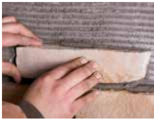
Install flat stones.