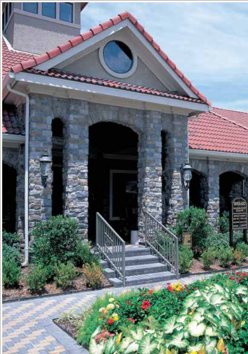
Austin Stone - Silver