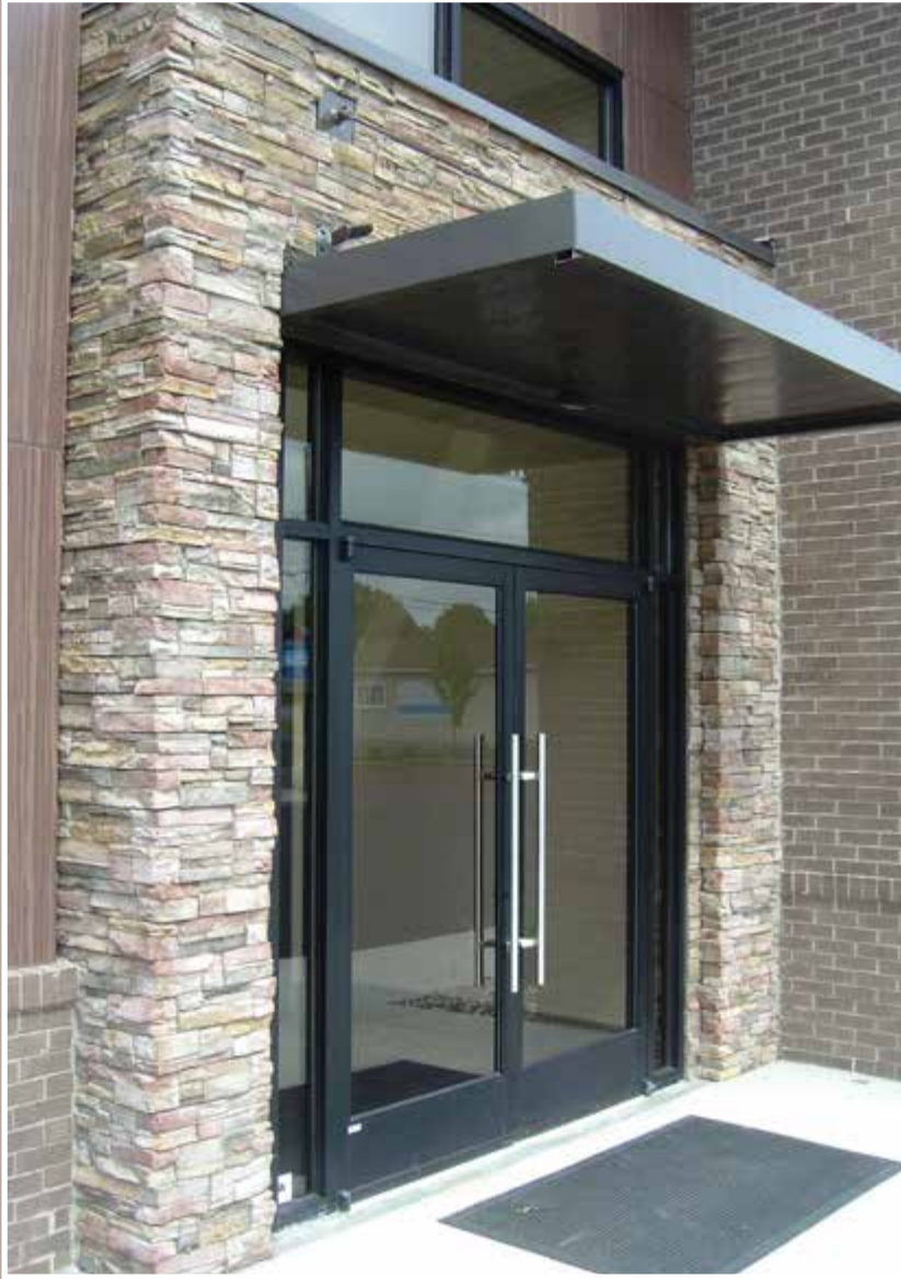
Imperial Stack - Creede Custom