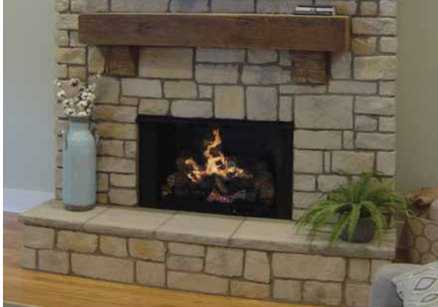
Austin Stone - Buckeye

The natural warmth and versatility of stone, coupled with your creative planning, can give your home or building the character and personality you desire. VENEERSTONE™ captures the beauty and durability of natural stone while offering you many key advantages.