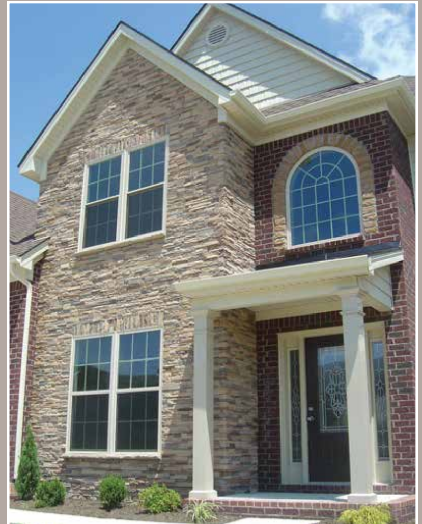
Imperial Stack - Malbeck