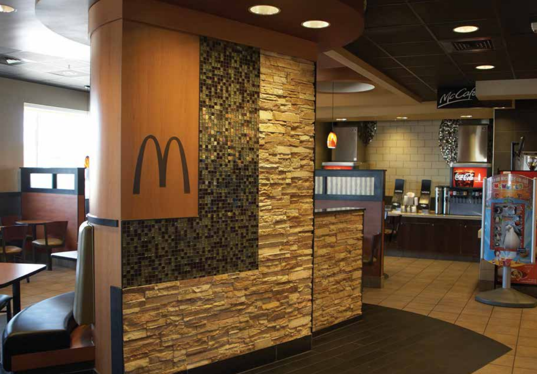
Imperial Stack - Millsap