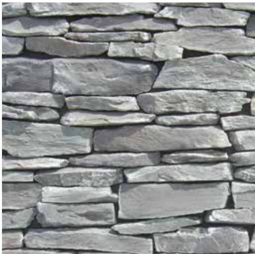
Shadow Ledge - Crestone