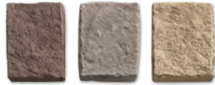
Espresso Grey Cream

StoneCraft accessories are designed to provide the finishing touch to any stone veneer application. Developed specifically to work in concert with any of our profile colors, each accessory is offered in three versatile colors.