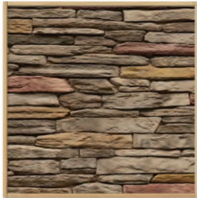
Chardonnay Laurel Cavern Ledge