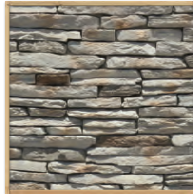
Hamilton Laurel Cavern Ledge