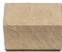
Peaked Wall Cap 20"L x 12"W x 2.375"-3.5"H 20"L x 16"W x 2"-3.5"H