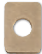
Light Box 8"W x 11"H x 1.5"D