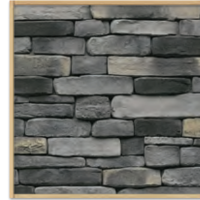
Kingsford Grey Ledgestone