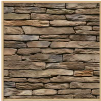
Asher Laurel Cavern Ledge

Laurel Cavern Ledge was meticulously crafted to create a timeless appearance. Handpicked from the rocky ravines and cliffs of North Carolina, this unique profile has rugged yet well defined features. Stones range from 1"-4¼" in height and 5"-18" in length.