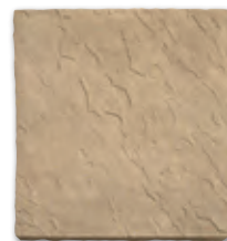
Hearthstone 19"W x 20"L x 1.5"H