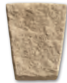
Keystone 8"-5.5"W x 10"H x 1.5"D